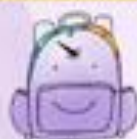
The Digital Backpack